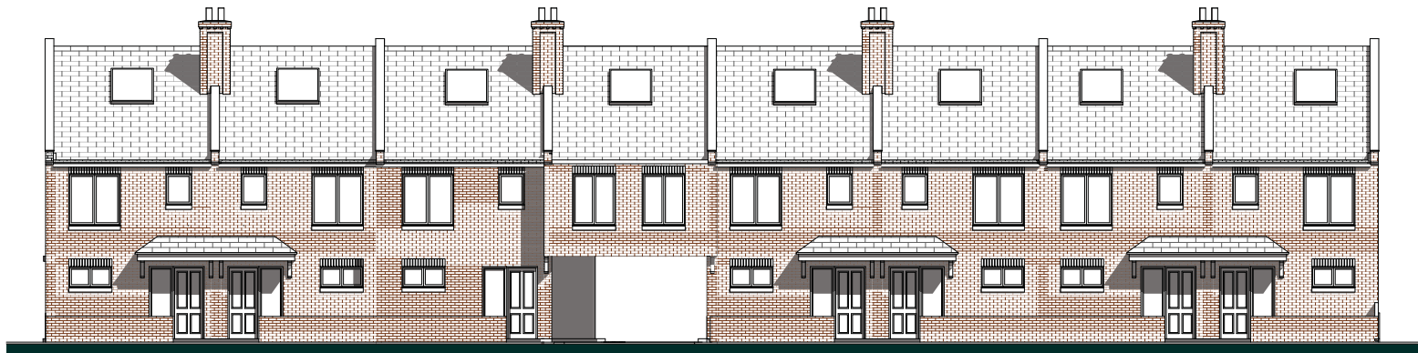
NORTH ELEVATION (JUDGE STREET)