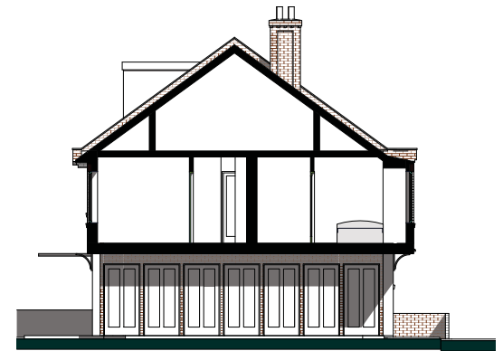
UNDERCROFTSECTION / ELEVATION